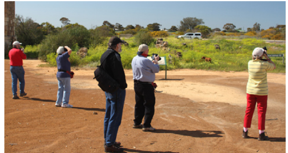
Now where’s the image?? – taken at Moonta Mines on the October long weekend – and not a tripod in sight!